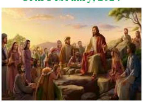
Gospel Reflection THE BLESSED IN THE KINGDOM

In the first reading prophet Jeremiah speaks about two types of people - the first those who trust in man and the second those who trust in the Lord God. He explains to us that the life of those who trust in man is as precarious as that of a shrub growing in the desert whereas the life of those who trust in the Lord God is as sure as that of a tree growing by the waterside. Blessed is the one who trusts in the Lord God.